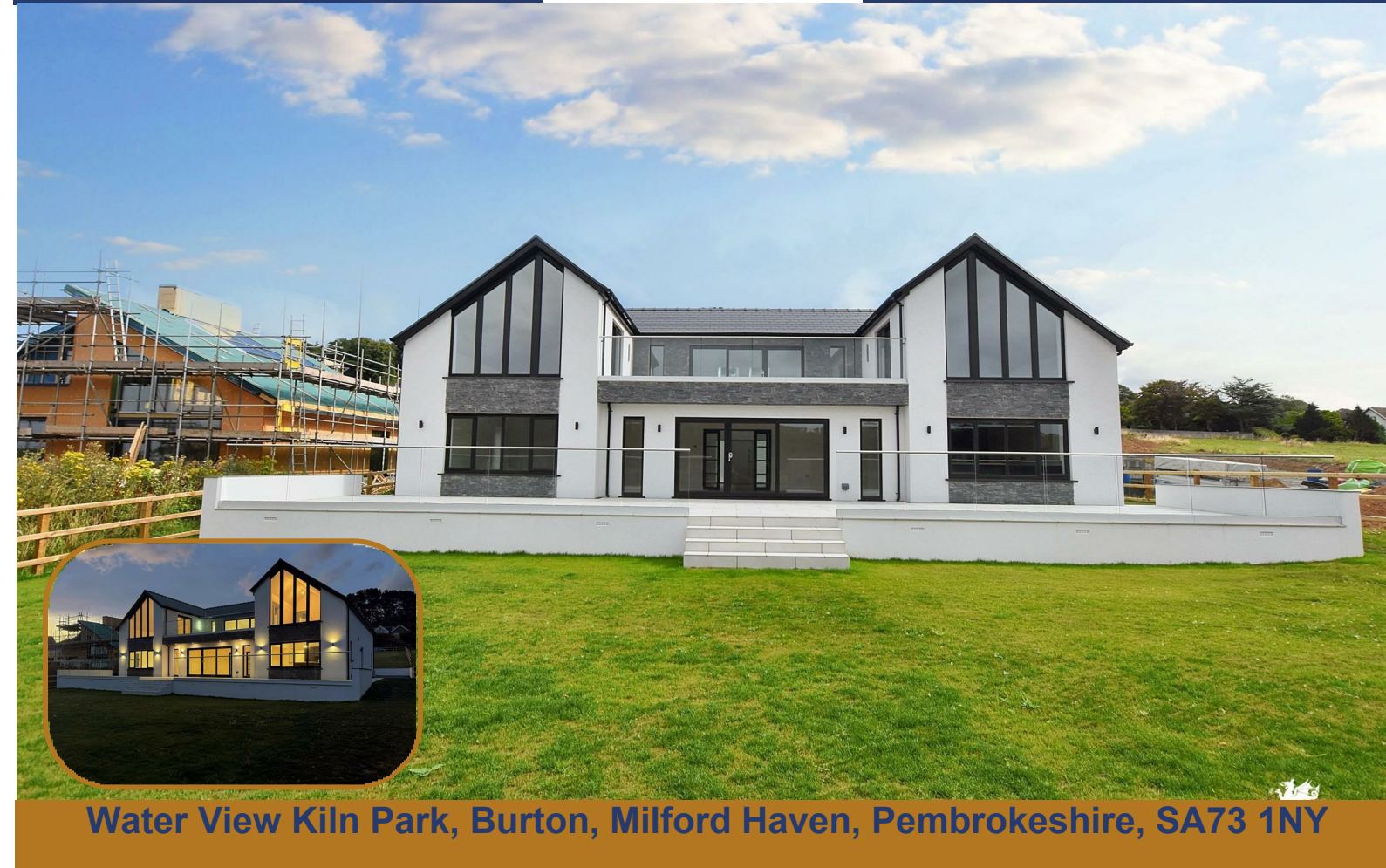
Water View Kiln Park, Burton, Milford Haven, Pembrokeshire, SA73 1NY